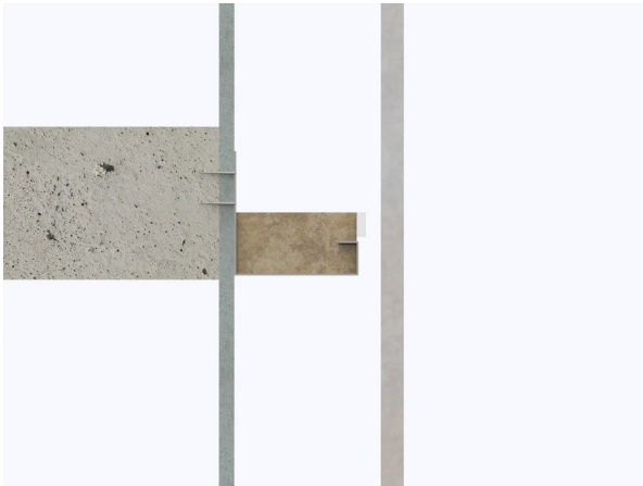
Side view showing rainscreen barrier held in place by the unique retaining bracket